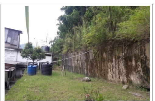
Retaining Wall Near Good Shepherd School at Papu Nallah, Naharlagun' executed at ₹ 10.00 lakh was found to be constructed inside private land

All the assets were created for the benefit of private individuals and not for the community. Land development work and ring wells were found executed inside private premises and the retaining walls were constructed for protection of private properties.