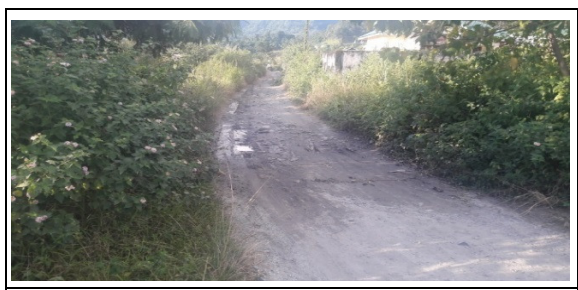
Rural Link Road constructed near Yatri Niwas, Roing executed at ₹ 3.00 lakh in 2018-19 was actually laying of granular materials on the existing road