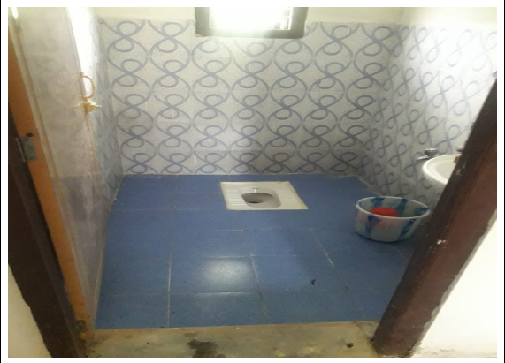
In place of kitchen, a toilet was found constructed at site in Papumpare district

The Reply from the Government has not been received (November 2020).