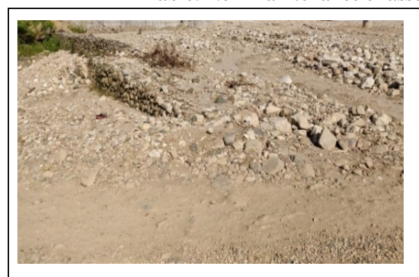
Table: Non-maintenance of assets under MLALAD Schemes

dilapidated condition, either due to lack of maintenance or poor execution of works. A few cases have been discussed below: